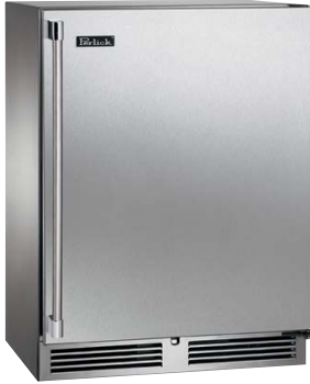
Solid Door Model

Perlick ® QUALITY & INNOVATION THAT INSPIRES