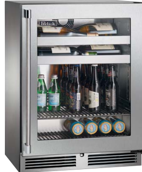
Glass Door Model